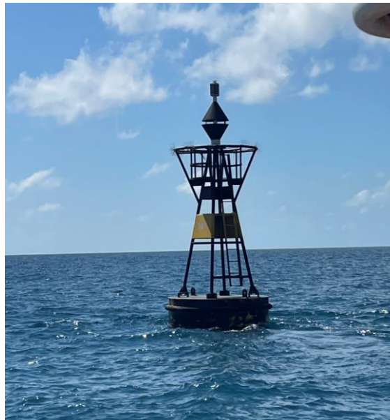
Unlit Navigation Aid – East Cardinal buoy

Marine and other port users are requested to notify the Kimberley Ports Authority on the discovery of new dangers or suspected dangers to navigation.