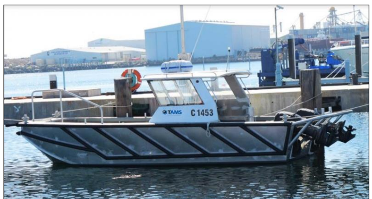
Picture showing TAMS boat 'AMS 14'

Marine and other port users are requested to notify the Kimberley Ports Authority on the discovery of new dangers or suspected dangers to navigation.