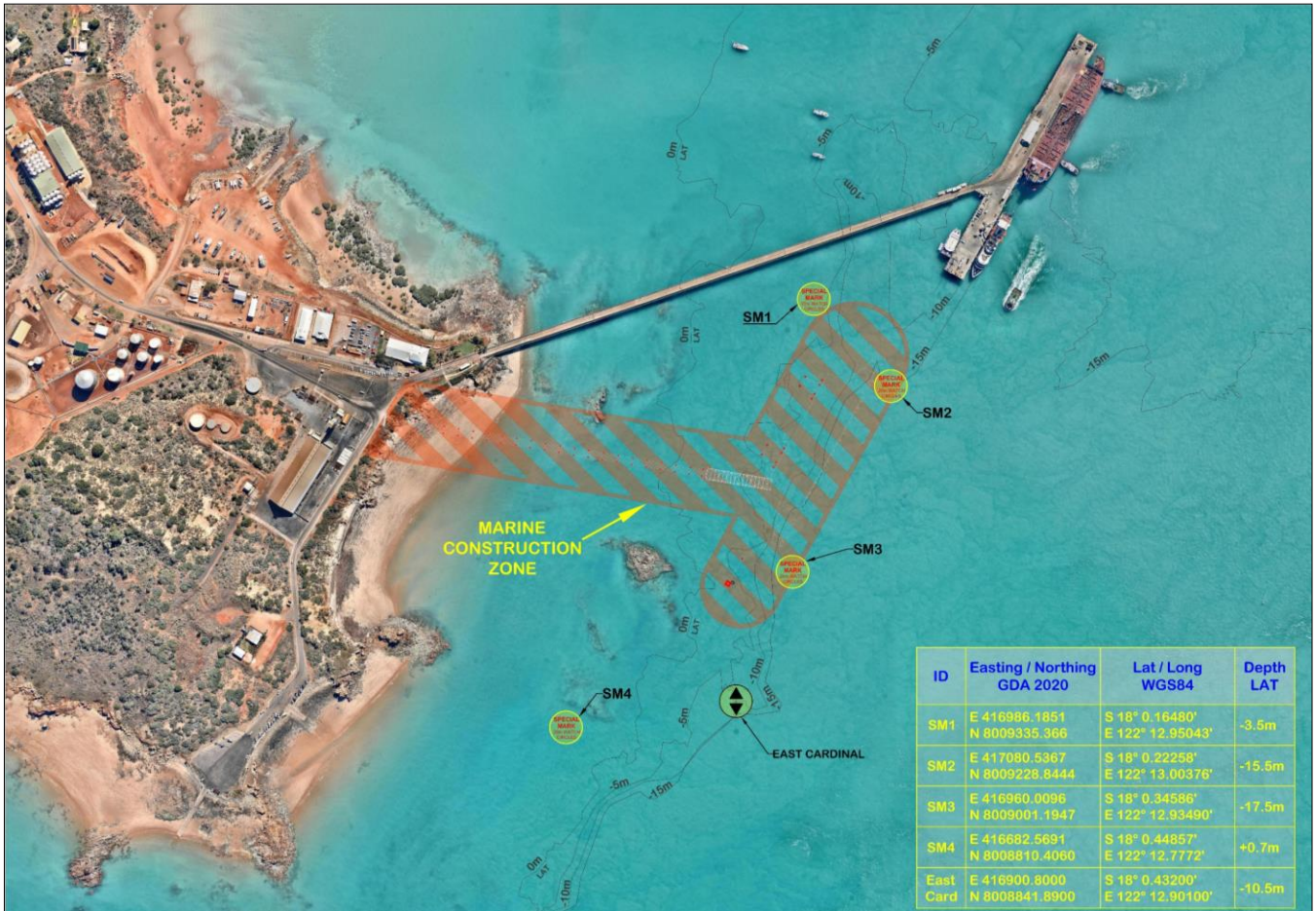
Chartlet showing the proposed Exclusion Zone