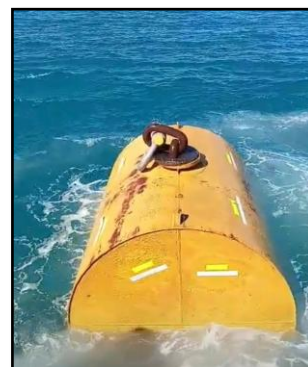
Image of Yellow Can Buoy with light (indicating a rising anchor chain)

Marine and other port users are requested to notify the Kimberley Ports Authority on the discovery of new dangers or suspected dangers to navigation.