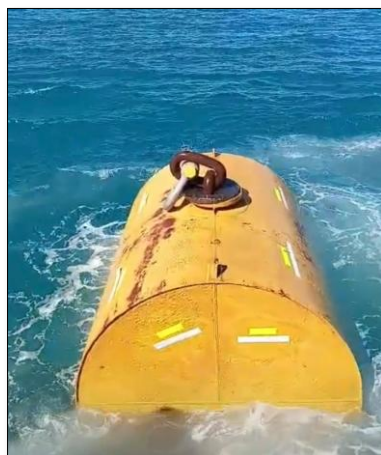
Image of Yellow Mooring Can Buoy with light. Installed at RB9 anchorage.

Marine and other port users are requested to notify the Kimberley Ports Authority on the discovery of new dangers or suspected dangers to navigation.