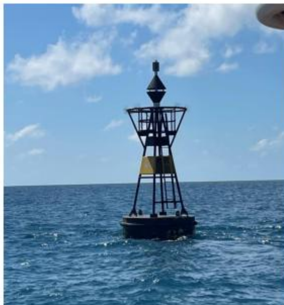
Parakeet East Cardinal Buoy Unlit

Marine and other port users are requested to notify the Kimberley Ports Authority on the discovery of new dangers or suspected dangers to navigation.